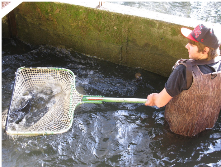
A student netting a returning Chinook at the Cunningham Creek STEP Hatchery

Location - Owens Conference Room across from the First Community Credit Union